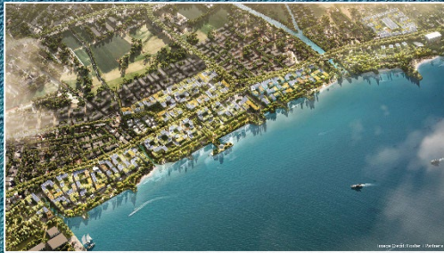
LARNACA WATERFRONT REDEVELOPMENT