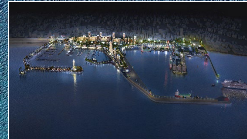
LARNACA MARINA & PORT REDEVELOPMENT